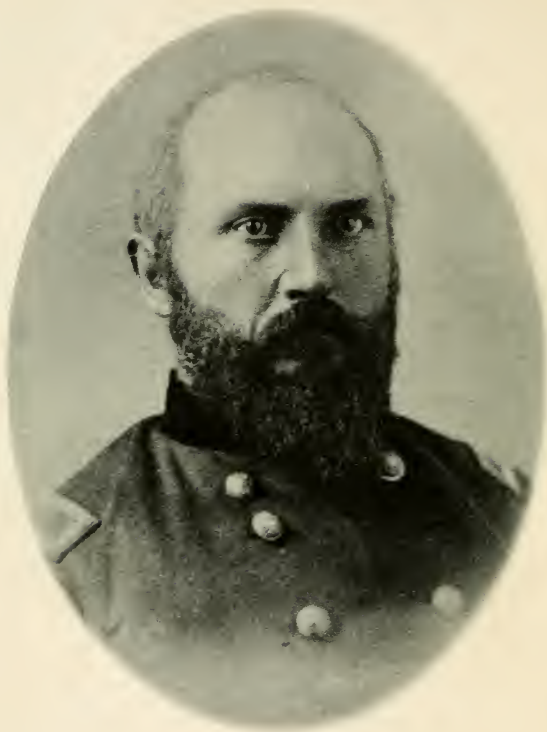
THOMAS T. CRITTENDEN.